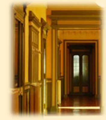
St. Petersburg, 07th October 2016

<u>Examples of</u> <u>lawful and unlawful use of</u> <u>keyword advertising</u> <u>and domain name</u>