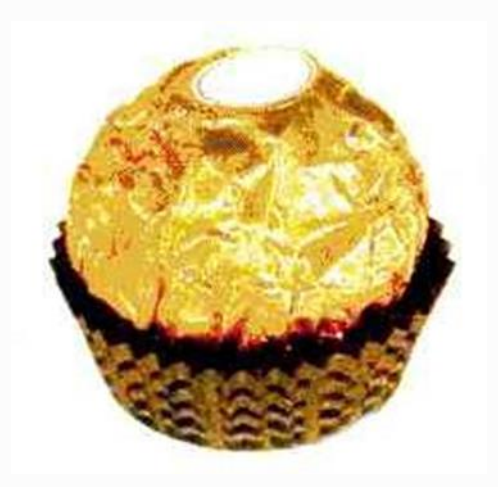
FERRERO ROCHER Madrid No. 783985